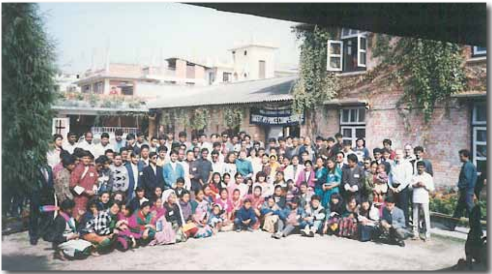
Historic Take it by Force conference attendees, March 1992 in Kathmandu . The effects, impartation and fruit of that conference spread all over Nepal .