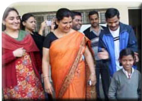
Young girl demonstrates she can hear clapping after Jesus opens her deaf ears at a Deaf School, along with many other classmates - Roorkee, Uttarakhand, India November 8, 2012.

morning at a local school. The smiles on their faces was priceless. They loved hearing music (songs about Jesus) for the first time in their life. Afterwards all the children prayed to receive Jesus as their Lord. All of this was caught on video. We uploaded it on youtube . It is titled “Jesus heals at deaf School in Roorkee, India” 📺