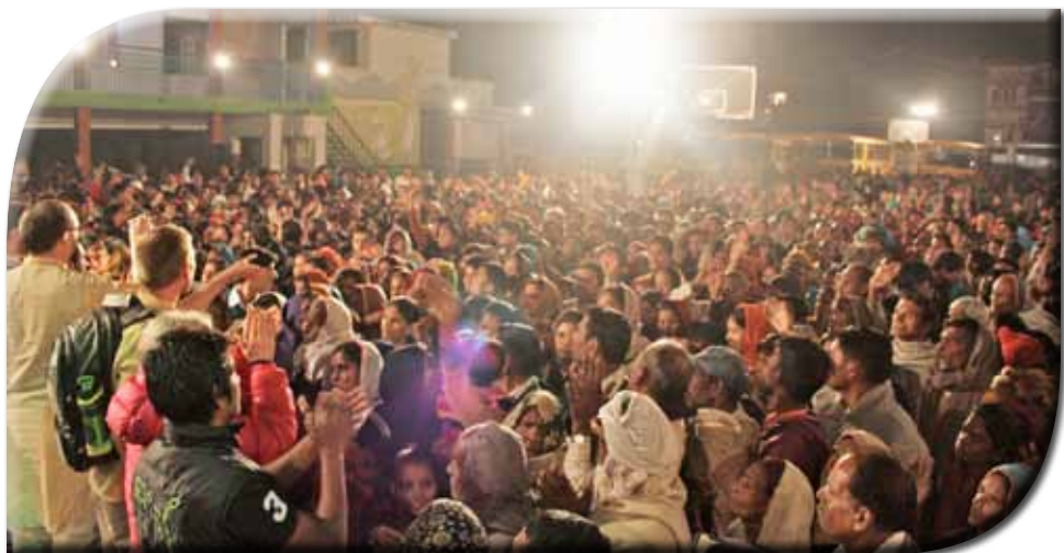
Many come forward to receive mass prayer for healing on the closing night in Roorkee, Uttarakhand, India November 9, 2012.

raised their hands. Our team of 5 laid hands on every kid. About 70 out of 80 kids were healed by Jesus. Many demonstrated they could hear us clap behind them as we tested their hearing. Then they wanted me to sing songs knowing I was a singer and had just performed a concert earlier that