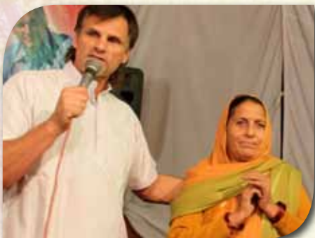
Saw light and Jesus. Knees healed!