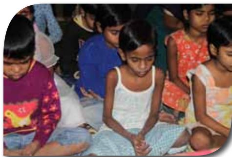
The Girls at Karishma Girls Home love praying - Agra, Uttar Pradesh, India.

With construction costs soaring in India, we are trusting the Lord for provision to complete the second floor so we can bring in 20 more girls from Orissa. We have to raise about $19,000 to complete it. 📌