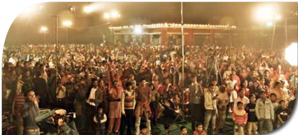
Ghaziabad, Uttar Pradesh, India campaign November 5, 2011.