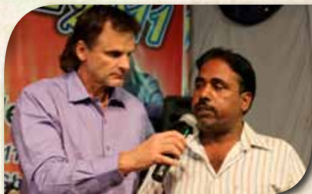
Felt an electric current and was healed.