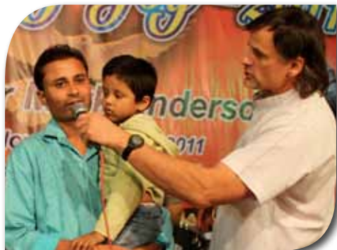
This man was in a severe motorcycle accident. He could only lift 5 lbs. Healed by Jesus! Lifts his son - Ghaziabad November 3, 2011.