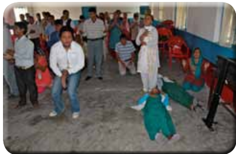
At Damak, Nepal leadership conference we had a powerful time of teaching and praying for leaders. Holy Spirit came in powerful way - October 2013.

They were used powerfully to lay hands on many needing healing or deliverance. They estimated they