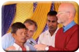
On the closing day in Damak, Nepal many people who were deaf were healed by Jesus - October 31, 2013.

saw around 150 to 200 healings take place. Here are a few: A preacher who had broken his arm had both