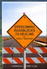
Mark's latest books