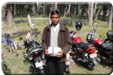
Main pastor who brought us into Sukhar, Nepal . Receives our books during training conference.