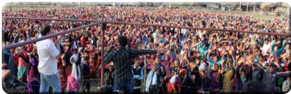
About 3,800 attend last day of Sukhar, Nepal outreach.