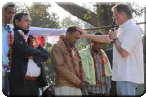
Praying over pastors before sending them out into crowd to pray for the sick.