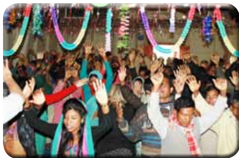
Leadership conference in Sukhar, Nepal . Many had powerful encounters with Holy Spirit during prayer for baptism of the Holy Spirit and impartation time.