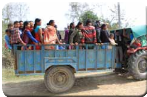
Main mode of transportation to and from open air campaign in Sukhar, Nepal .