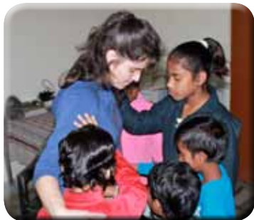
Girls from Karishma Girls Home love praying over our team members.

Our final ministry stop was on Sunday morning where we ministered at the Family of Lord Jesus Church. This house church started a year ago with 8 people and today has about 100 members, 95% of them previously Hindus who have just accepted Jesus in the past year. 200+ people attended