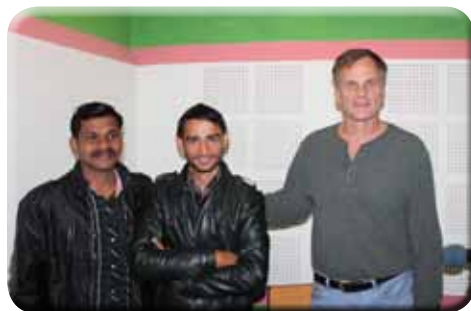
Sukhar, Nepal Radio station manager wants us to broadcast 30 minutes daily, the Gospel of Jesus Christ on his station. This station has a listening audience of over 1 million people.