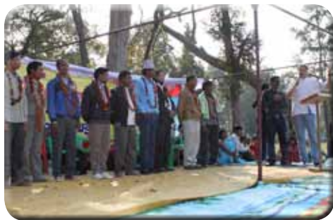
Introducing pastors to the audience and encouraging new believers to go to their church.