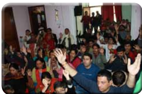
House church meeting in Delhi, India. 200 people showed up for the service. 100 turned to Christ.