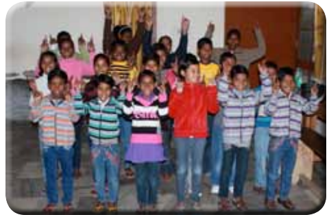
Girls from Karishma Girls Home Agra, India perform for us on recent visit.

Our main event for this trip will be a large open air campaign and leaders conference in a remote unreached area of north India. The outreach will be in Polygunj, Uttarakhand State . We will have our largest budget ever for an outreach. Petrol prices have been soaring. We plan to bus in thousands for this outreach. We covet your prayers as multitudes will be hearing of Jesus for the first time in their life. We are looking forward to this outreach with great expectancy. ●