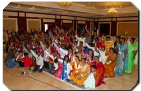
Leadership conference Ranchi, India October 15 & 17, 2016.

lot of miracles and healings in both cities. In Allahabad I gave a word of