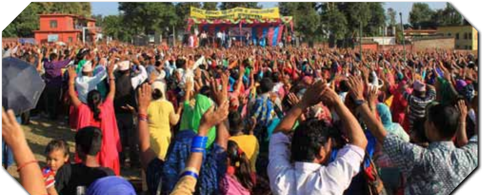
Crowd 2nd night in Surkhet, Nepal Oct 20, 2016.

We thank God for favor in Nepal in a time when persecution is greatly increasing towards Christians. Leading politicians from Kathmandu, key military and law enforcement officers come out in support of our outreach. Nepal has the fastest growing Christian population (per capita) in the world. Now over 10%. The