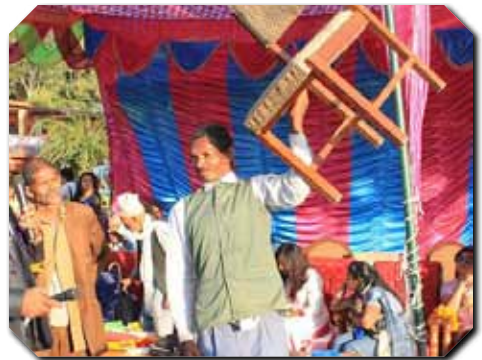
Broken wrist healed. Had much pain. Demonstrates wrist is healed - Surkhet, Nepal Oct 2016.