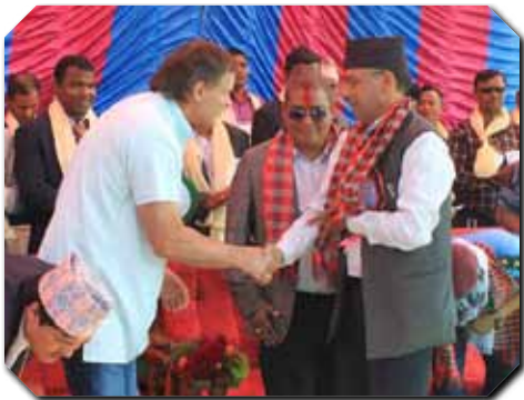
Great favor in Nepal despite persecution against Christians increasing nationwide. Key Nepali politicians, police chief and military leader come out in support of campaign - Surkhet, Nepal Oct 19, 2016.

as persecution of Christians in India and Nepal is greatly increasing under the present India government. India's present government has made it plain that they only want Hinduism in India