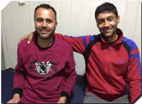
Two men from Syria who had recently fled for their life. Both were healed of all the pain in their bodies and said 'no pain!'

Besides visiting one other refugee camp we also did manual work at a youth camp that will host refugee children and at a Refugee Daycare Center that was about to open to serve the refugees. The evangelical Churches have come together and started this outreach. Along with others from the team we built