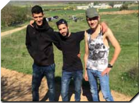
Three young Muslim men who fled for their lives from Syria.