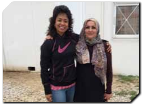
This lady's husband was killed by ISIS.

While we saw the beauty of these people and the grief of their circumstances, we also saw the evil and wickedness that is lurking in their midst taking advantage of this crisis first hand. On our last visit to the camp as we were preparing to enter the camp, a man with blood gushing down his face and a knife in his hand came out chasing the man who had stabbed him, followed by a group of 10-12 men. We had to leave and the camp was on lock down. These violent incidents are all caused by the Moroccans, Algerians, Tunisians and Albanians, who are illegal immigrants (they are referred to as illegal immigrants in Greece, I have not come up with the term). Most of them are young single men. They are taking advantage of this crisis and are infiltrating the camps causing trouble. They are given to alcohol, drugs, rape and cause mayhem in the camp. They have no right to be there, but such is the nature and confusion of war, the innocent and truly needy are taken advantage of by the corrupt and cunning. As we interacted with the refugees and illegal immigrants, I saw two very different spirits in operation. The refugees are gentle, calm and loving, whereas on the illegal immigrants there rests a spirit of agitation, contention and confrontation. It is in the way they talk and carry themselves. Many of the single women