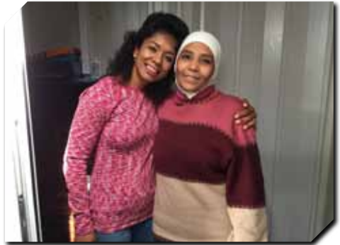
This lady suffered with back pain and headaches. When we prayed in Jesus name her leg came out one inch and all pain left her body. Her last words to me was 'no pain!'