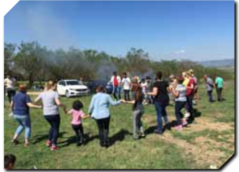
Dancing with Syrian Kurds.