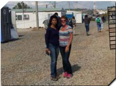
One of the camps we served in.

Drone footage from Aleppo, Syria shows bombed out homes: http://www.birminghammail.co.uk/news/midlands-news/uk-urged-send-armed-forces-12010248