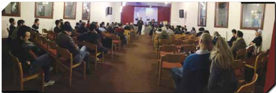
Ministering at the Refugee Church in Hamburg, Germany .

We connected with Pastor Gerhard in Ludwigslust, East Germany to reach out