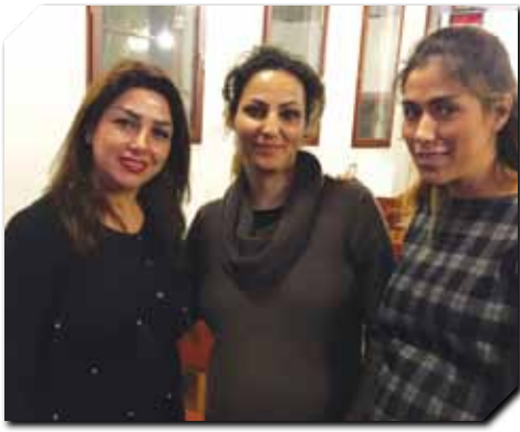
These ladies (2 pregnant) were healed of back pain after the shortened leg came out - Hamburg, Germany November 19, 2017.