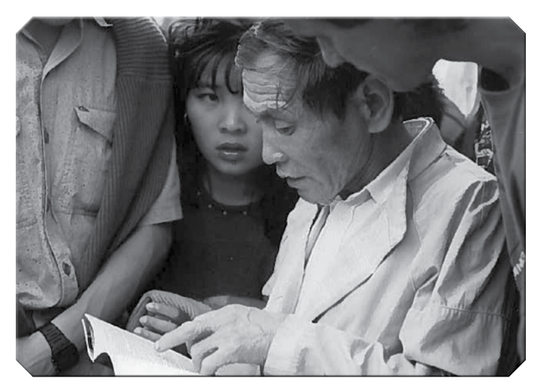
Deaf and partially blind for many years. Instantly healed by Jesus during outreach on the streets of Ullan Bator , Mongolia August 1992 .