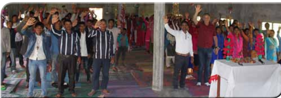
Leadership Conference - Jogipur, Nepal March 2019.