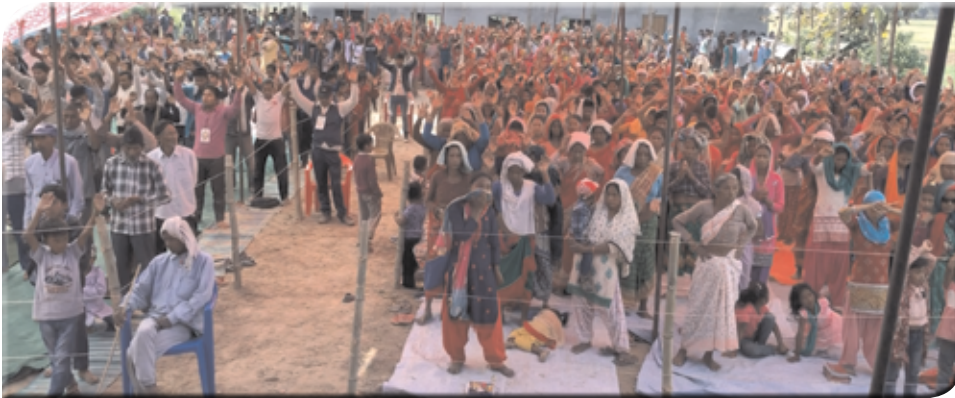
Crowd shot - Jogipur, Nepal March 2019.