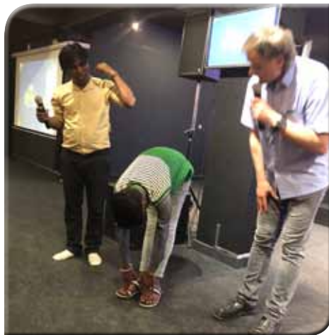
Young man had X-rays that his flesh and muscle was tearing away from his spine. Lot of pain! Healed by Jesus and able demonstrate healing! New Delhi, India March 10, 2019.