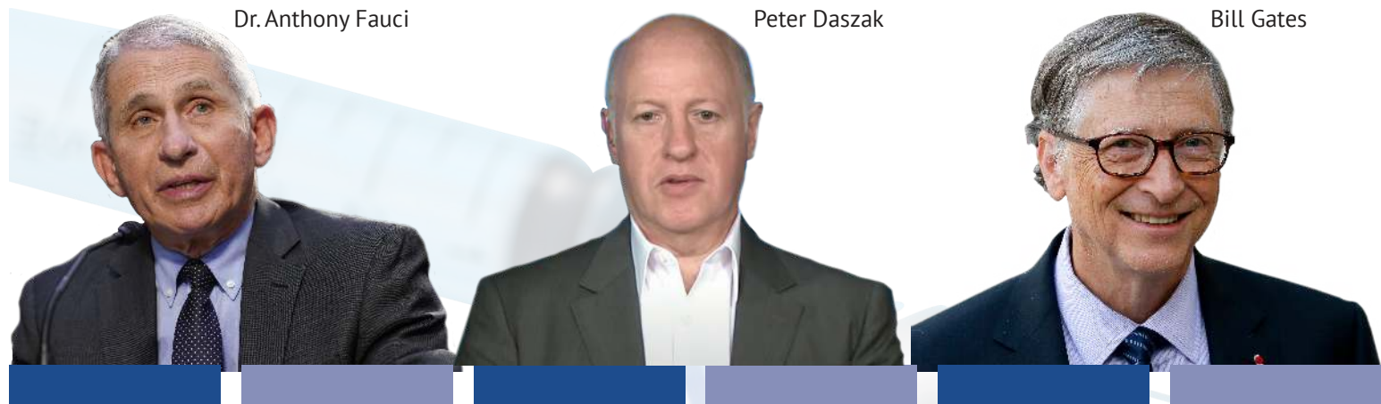
Dr. Anthony Fauci