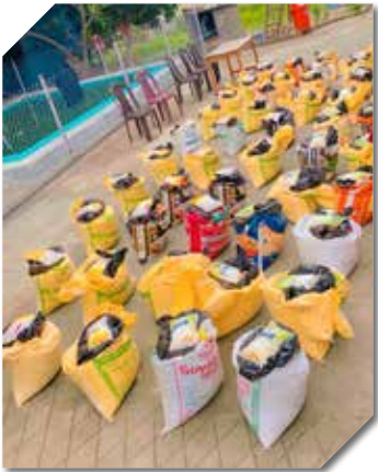
Care packages for those starving in Nepal provided by Mark Anderson Ministries and its partners!

to Christ. Most of those came through the food distribution. He has also planted 12 house churches. He has also taken care of people staying in the church who lost their homes in the flooding. Because