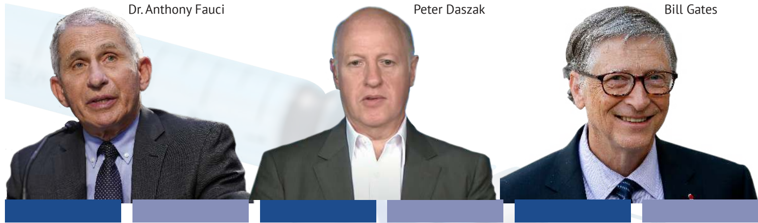
Dr. Anthony Fauci