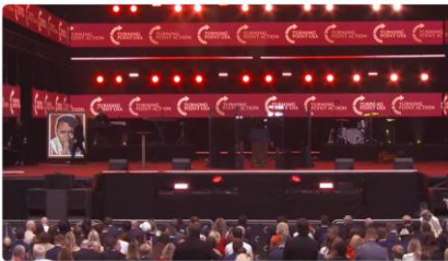
WATCH: Charlie Kirk's memorial service at State Farm Stadium

Erika Kirk forgives her husband's assassin. The power of forgiveness! It will bring tears to your eyes: