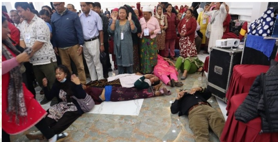
Our team prayed over all 733 Pastors and leaders for impartation. Many had encounters during ministry time.