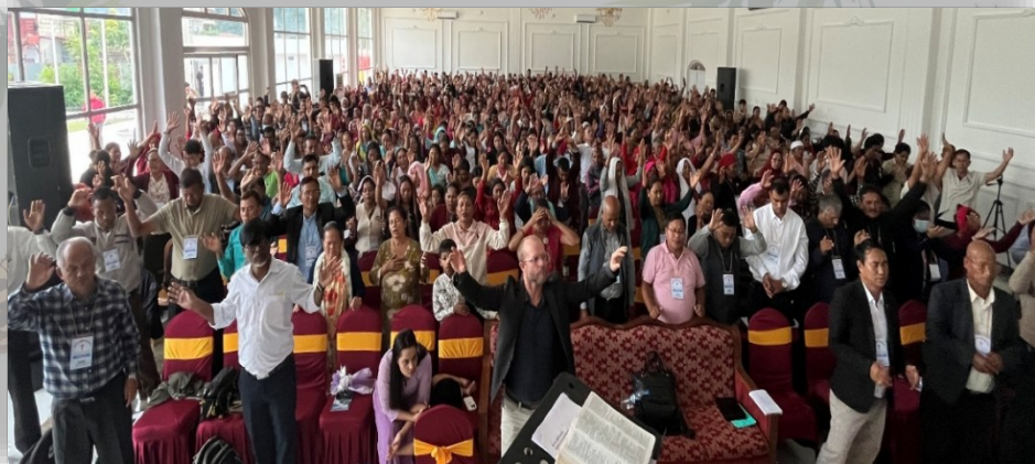
733 Pastors and leaders attended our 3 day conference in Damouli, Nepal October 28-30, 2025

much for those of you who prayed and gave for this trip!!! This was accomplished only with your prayers and support.